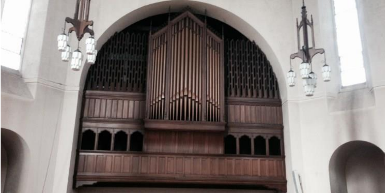
The organ at St. James' Church

The feature for this newsletter is the organ at St. James' Church , Casavant Organ, Opus 1605. This is one of the organs on our upcoming organ crawl.