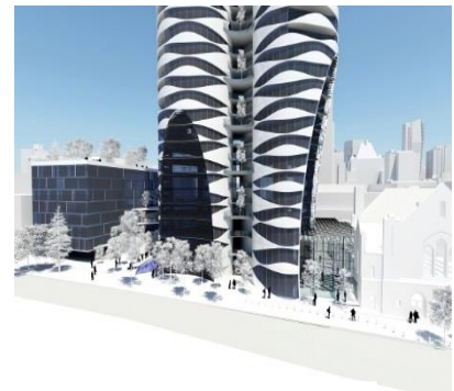
First Baptist design plan

First Baptist Church at the corner of Burrard and Nelson owns five lots in the heart of downtown Vancouver and plans to carry out one of the most substantial undertakings: a 56-storey skyscraper (for 300 condominiums) next to its church building, along with another smaller building for affordable rental. It hopes to build an atrium in between the edifices for a community gathering space. Architect Bing Thom has designed the larger building to resemble a set of organ pipes (albeit, more of an impression than an imitation).