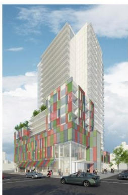
Central Presbyterian design plan

Only a few blocks away, Central Presbyterian Church has recently demolished their old building on Thurlow Street (and are currently having their services at the Best Western on Davie Street). They intend the church to be part of the multi-storey complex soon to be built. Their beloved pipe organ was carefully removed and stored safely before the demolition.