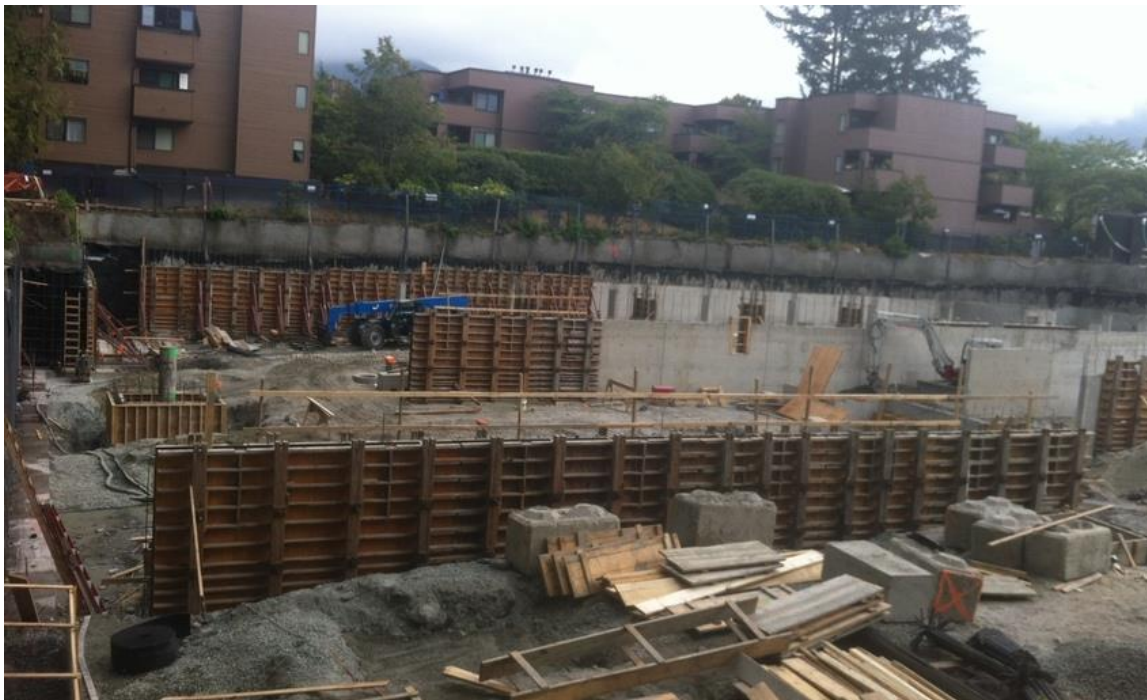
Construction at Lynn Valley United

On the North Shore, Lynn Valley United Church has already leveled their old building, and construction is progressing smoothly, with the Church/Condo design already finalized and structures slowly and surely being completed.