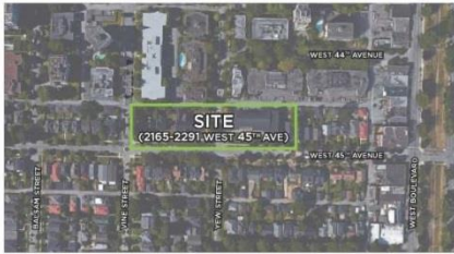
RYERSON UNITED CHURCH SITE MAP

In Kerrisdale, Ryerson United Church is planning to redevelop their lot at 45th and Yew. This primarily involves updating the sanctuary, restoring the heritage building, adding more parking, and demolishing the Ryerson Memorial Centre to build a community activity centre, and non-market rental housing.