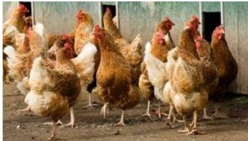
bok bok bok Bach Bach Bach Bach Bach Bach

This is a chance to hear some of our local talent, and I strongly encourage you to come out and enjoy an evening of wonderful music. It will be followed by a reception and a chance for all of us to socialize with people who share our interest in the organ and its music.