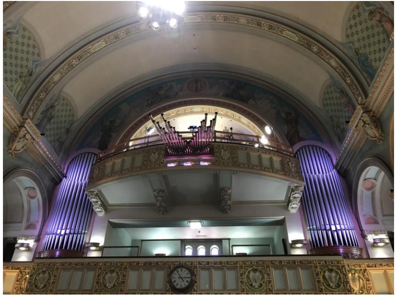
Saints-Ange church, Lachine

On day one, my shoulders were puffed up with eagerness trying to listen and absorb every line of music and all the lessons. I made a point of attending all the workshops or master classes and all the concerts I could possibly manage. I am well aware that it is my very weakness. I just cannot relax and take things easy. Let me describe a day as an example. It started with an early morning church service, and when it was over I searched for the next venue