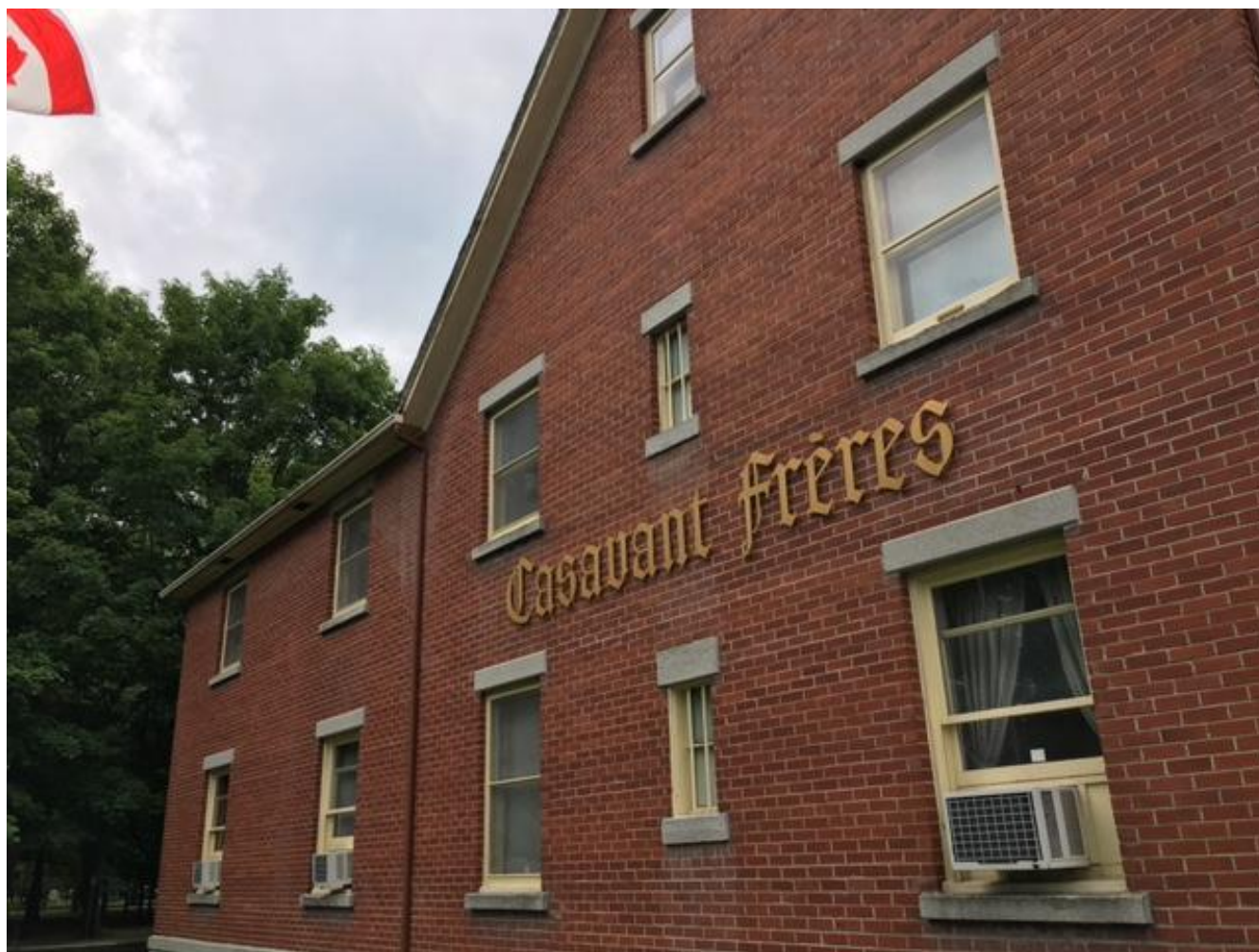
Casavant Organbuilding factory

And pommes frites and wine at the hotel at 11:00pm July 7.